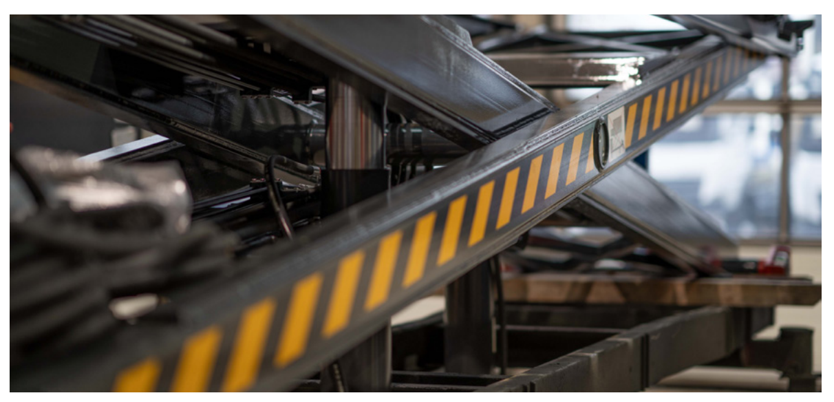
Fully electrically driven scissor lift