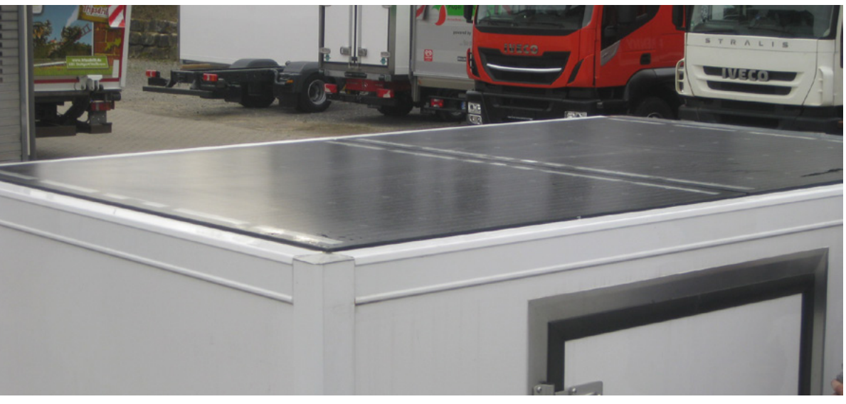
For additional battery charge: solar panels on vehicle's roof