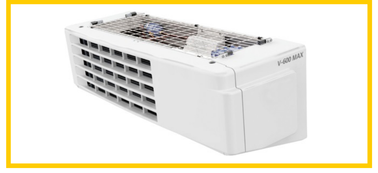
Fully electrical cooling unit